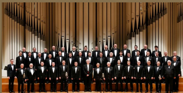
The choir performing its 95th anniversary concert at the Slovak Radio building

The central image is based on the logo of the Slovak Teachers' Choir, showing the head of a woman with long flowing hair in left profile. The upper part of the design depicts horizontal parallel lines overlaid with the Slovak coat of arms and, below it, the name of the issuing country 'SLOVENSKO'. In the middle of the lower part is a silhouette relief view of Trenčín, positioned above the coin's denomination and currency '10 EURO' and below the year of issuance '2021'. Between that date and the silhouette image are the mint mark of the Kremnica Mint (Mincovňa Kremnica), consisting of the letters 'MK' placed between two dies, and the stylised letters 'ZF' referring to the coin's designer Zbyněk Fojtů.