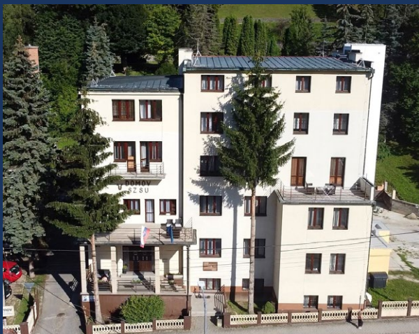
The Domov SZSU building in Trenčianske Teplice

The Slovak Teachers' Choir (Spevácky zbor slovenských učiteľov – SZSU) was established in the town of Trenčín on 3 March 1921, its founding motto being “ To inspire love for the nation through singing ” (“ Spevom budiť lásku k rodu ”). Its emergence stemmed from efforts to deepen fraternal relations between Slovaks, Czechs, and Slavs in general and to edify the Slovak nation. For one hundred years, the choir has existed as a Slovak-wide amateur male singing ensemble. While its membership is composed mainly of teachers, it also includes people from other occupations. A permanent home for the choir – Domov SZSU – was established in Trenčianske Teplice in 1933, paid for partly by contributions from teachers. In 1961 the choir “handed over” its property to the Revolutionary Trade Union Movement (Revolučné odborové hnutie). Since 1968 Domov SZSU has been administered by the state, at present through the Ministry of Education, Science,