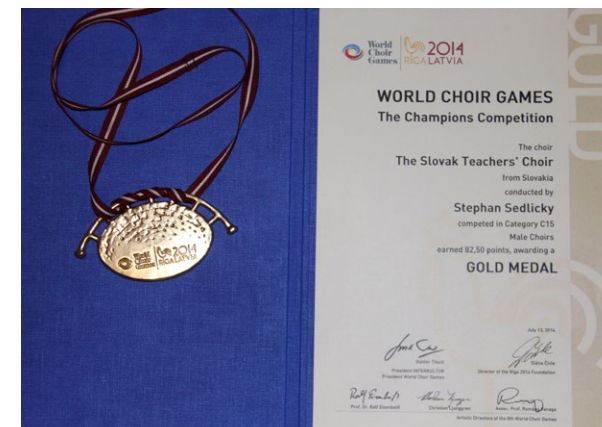
The gold medal awarded to the choir at the 8th World Choir Games in Riga in 2014