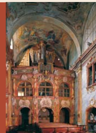
St Emmeram Cathedral