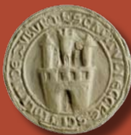
Seal of the chapter of the Church of St Hippolyte