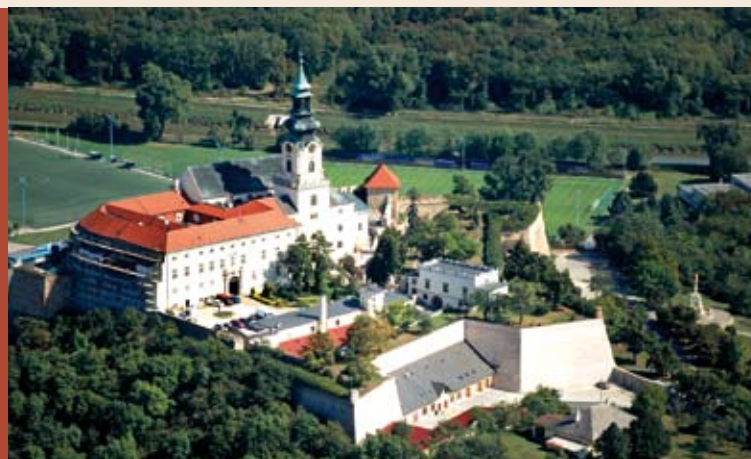
Nitra Castle with the cathedral and the bishop's palace