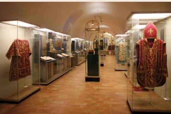
The Museum of Nitra Diocese exposition