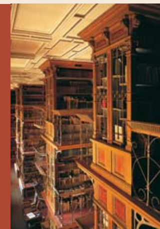
The Diocesan library