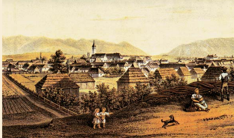
The view of Turčiansky Sv. Martin in the mid-19th century

served as a parish pastor in Zvolen and Banská Bystrica. From 1849 to 1860 he lectured at the Evangelical Faculty of Theology in Vienna. Later he worked as a superintendent according to the patent in Banská Bystrica and from 1863 in Martin, where he was also pastor and serving deputy chairman of Matica Slovenská, the national cultural institution of the Slovaks.