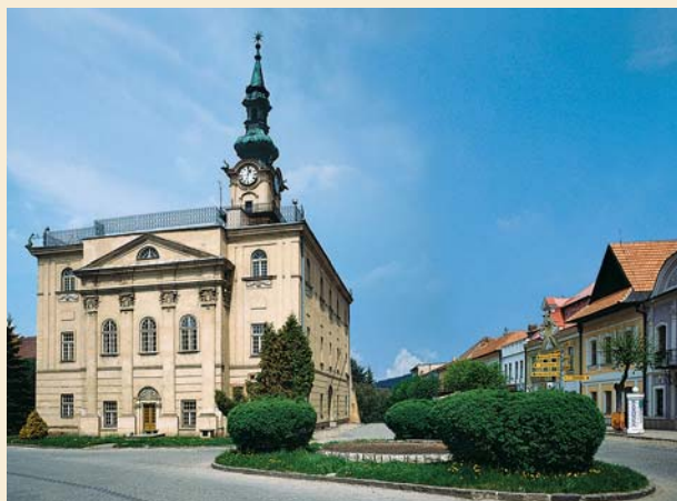
Kežmarok, the seat of an important Evangelical Lyceum

In the 1850s, when Štúr’s generation withdrew from public life and there was hardly any possibility for literary and cultural activity, the centre of gravity of Kuzmány’s work lay in the theological field. He collected his university lectures into a three volume work in German: “Praktische Theologie”. His creative literary activity continued until the end of his life. He died on 14 th August 1866 in Turčianske Teplice and was buried at the National Cemetery in Martin.